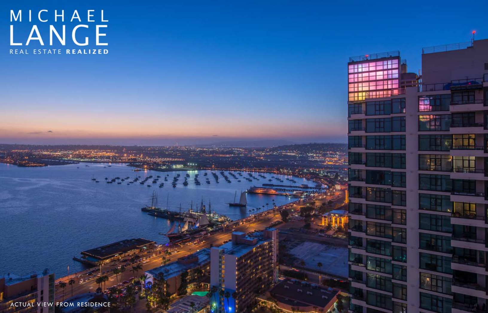
ACTUAL VIEW FROM RESIDENCE